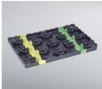
Contoured insert for dual clutches, designed for automatic loading and unloading