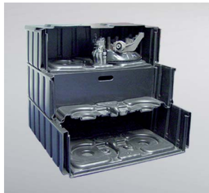
TWINBOX 800/1200 (cutaway view)