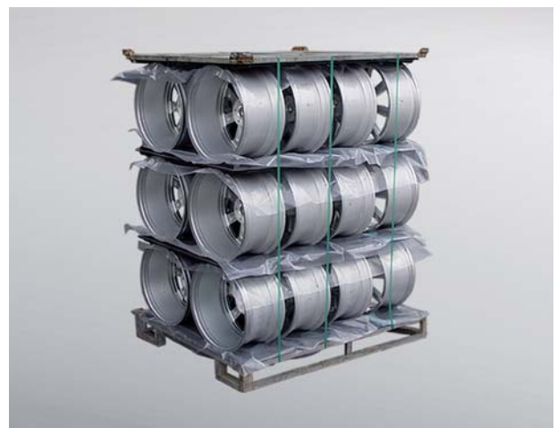
Standardized separators for vertical wheel transport