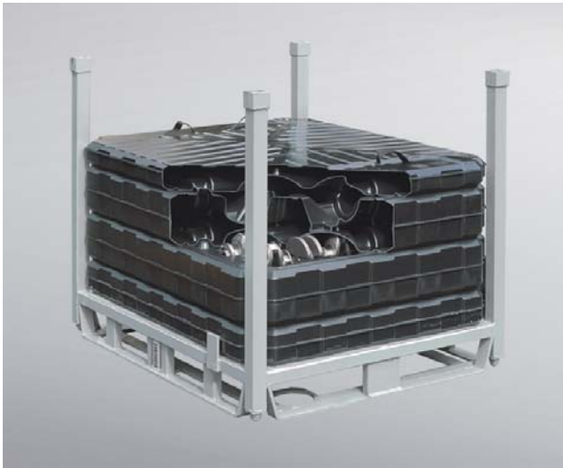
Loading unit for passenger car crankshafts, ABS with TPU coating

bilaterally different shapes and colours – also in different material qualities. Individual colour designs and labelling enable automation-friendly loading and unloading.