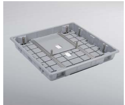
Tray for PCBs, designed for robotic handling