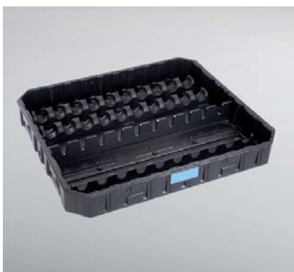
Twin-Sheet-Behälter für Gelenkwellen