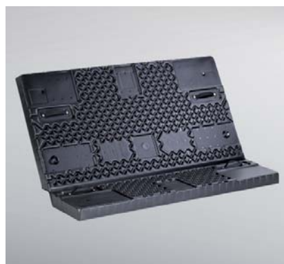
Klappeckel für div. Faltbehälter-Systeme