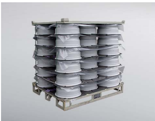
VDA/EUWA 4503 separators for horizontal wheel transport