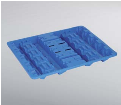
Separator for cranks shafts, stacking weight is supported by the parts

and ensures optimal volume utilization. Design features can be included for manual or automatic handling in accordance with the intended use.