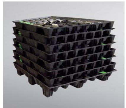
Packing system consisting of base pallet, separators and lid, stack-and-nest system