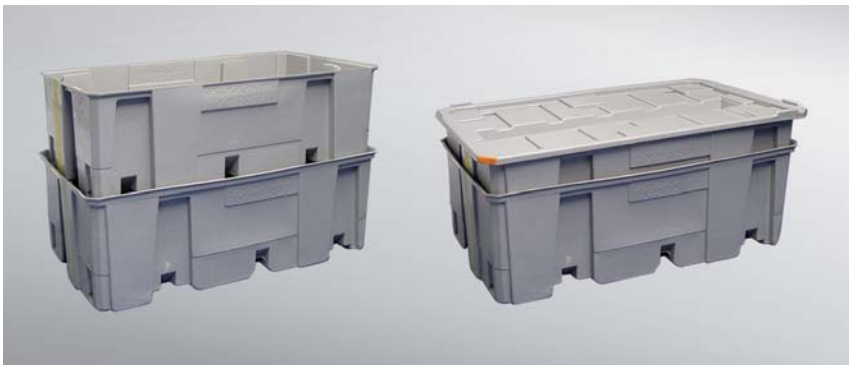
Stack-and-nest transport container for intake manifolds – with space-saving return transport