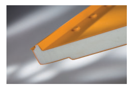
PU- / RRIM-Technology