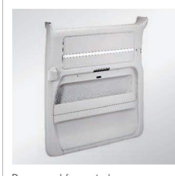
Door panel for motorhome