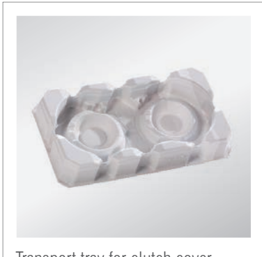
Transport tray for clutch cover