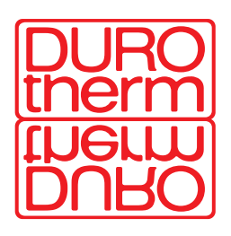
More product examples: www.durotherm.de