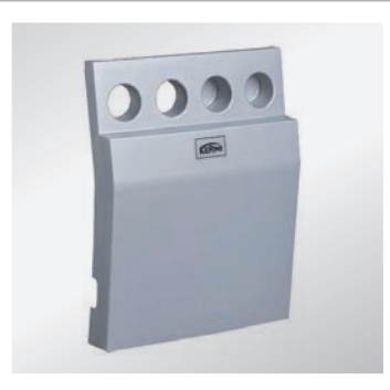
Cover for heating control